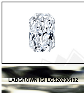
LASERSCRIBE SM Sample Images Used

Comments: This Laboratory Grown Diamond was created by Chemical Vapor Deposition (CVD) growth process and may include post-growth treatment. Type IIa