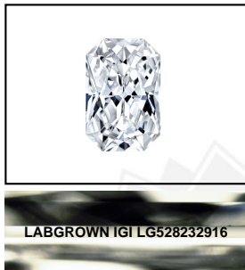
LASERSCRIBE SM Sample Images Used

Comments: This Laboratory Grown Diamond was created by Chemical Vapor Deposition (CVD) growth process and may include post-growth treatment. Type IIa